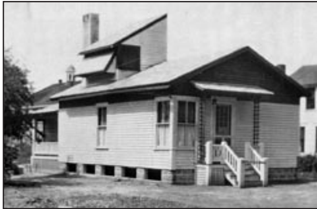
Studio, Deering Street, Norway Maine